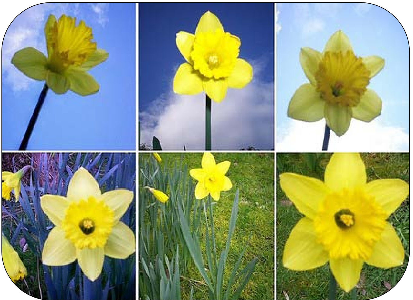
St David – 1 st March