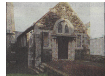
HALL: Sunday School venue